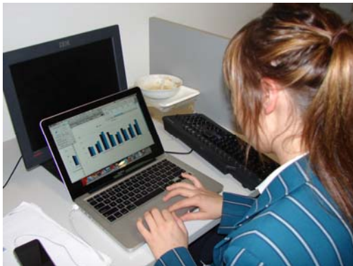
How important is it that students are given choice over the type of laptop they bring to the Senior School?